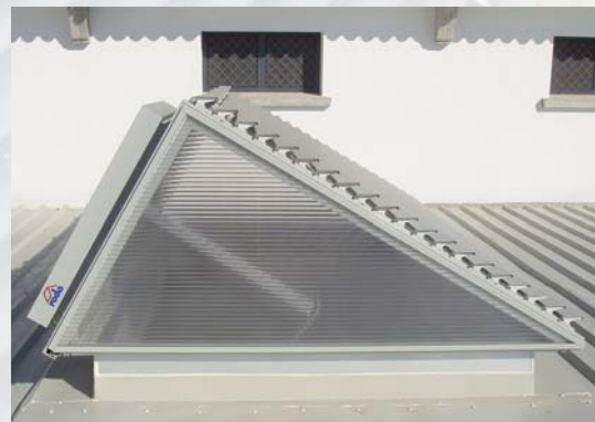
Asymmetrical DELTALIGHT with shading