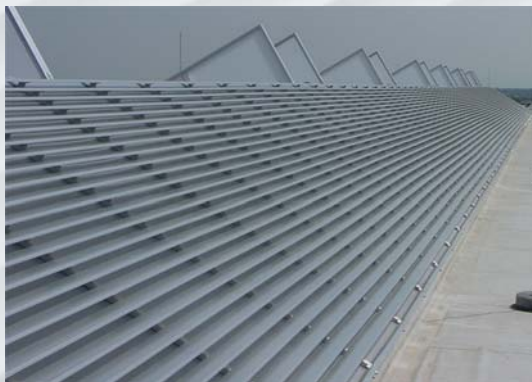
South side shaded DELTALIGHT